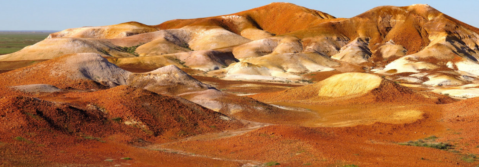
The Breakaways, Coober Pedy, South Australia