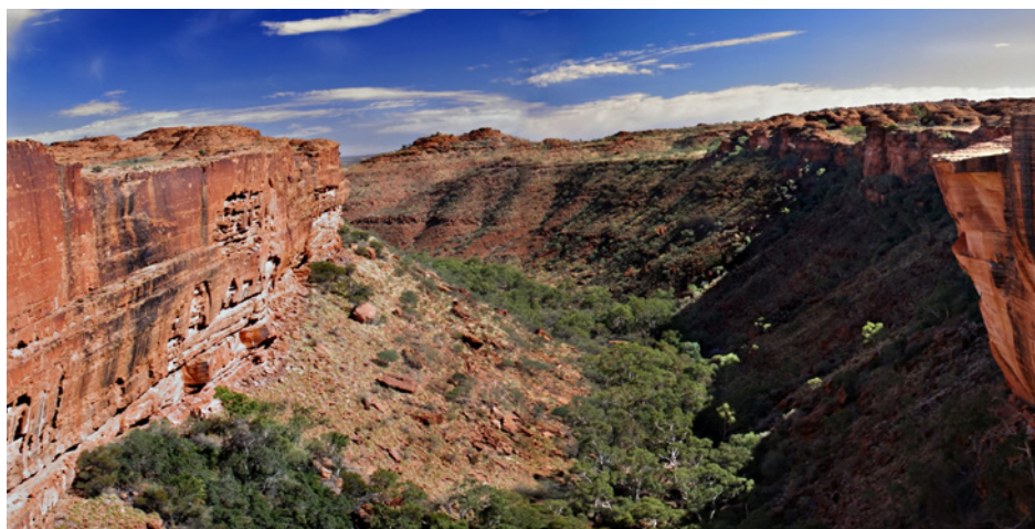
Kings Canyon, Northern Territory

Visit Anzac Hill for a panoramic view of Alice Springs before an Aboriginal Cultural tour to the Alice Springs Desert Park. Visit Alice Springs School of the Air established in 1951 to provide educational service and activities to isolated school children.