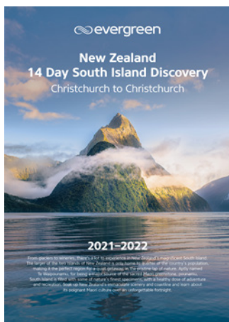
New Zealand Touring