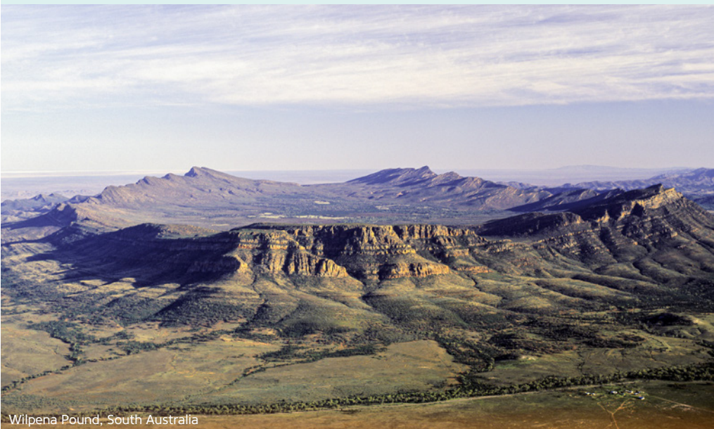
Wilpena Pound, South Australia