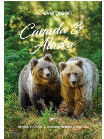
Canada & Alaska Touring