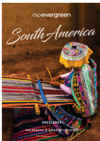
South America Touring