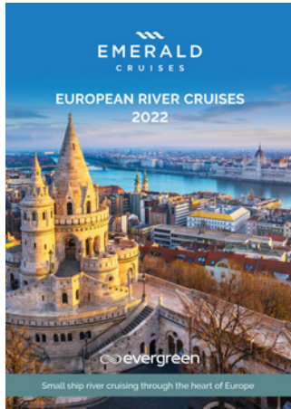
European River Cruises