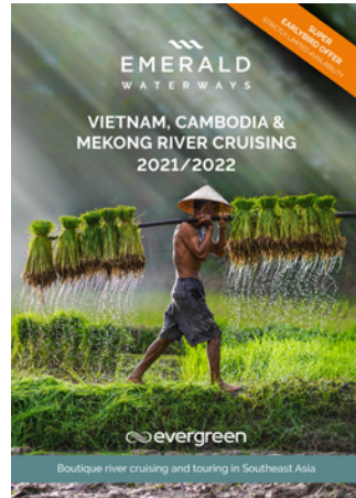
Vietnam, Cambodia & Mekong River Cruising