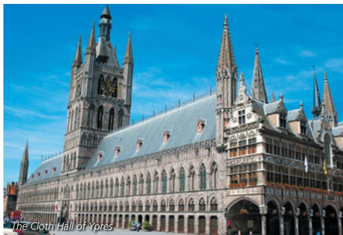
The Cloth Hall of Ypres